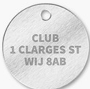
Side 1 Complies with the law

Note: Examples of the information required on a tag/disc/plate or on the dog's collar are suggested below.