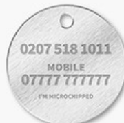
Side 2 Note: Side 2 information is optional but highly recommended by the Kennel Club Good Citizen Dog Scheme