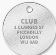
Side 1 Complies with the law