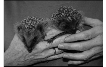
Two little orphans found on Haverhill industrial estate

Something is wrong—it shouldn't be there! It needs help fast!! Or simply a hedgehog you think is in difficulties.